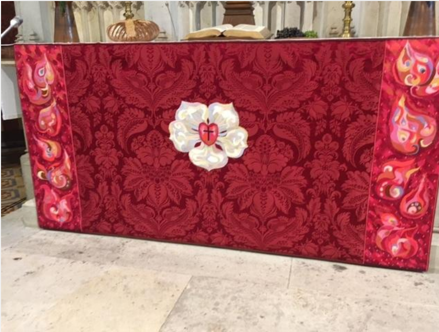
The new antependium created by the Queen.